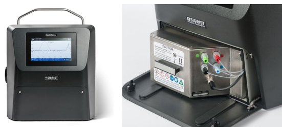
Figure 2: BactoSense with cartridge

It detects over 99% of all microbial cells and provides the results within only 20 minutes. Thanks to these measurements, actions can be taken to maintain a stable drinking water quality.