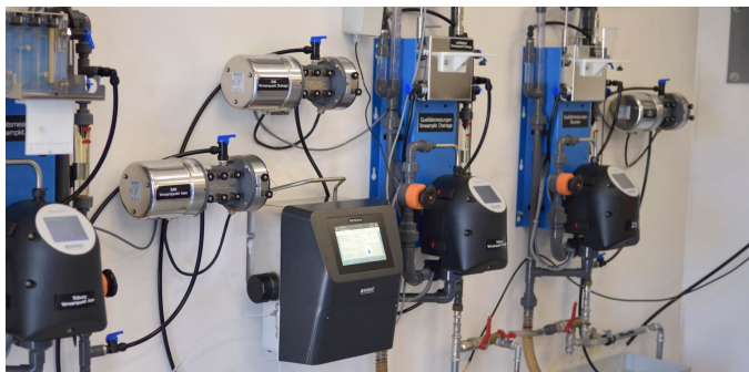
Figure 3: BactoSense installed in a groundwater well