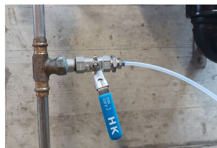
Figure 5: Simple control of the required water flow rate of 200 to 400 ml/min when continuously measuring with the BactoSense