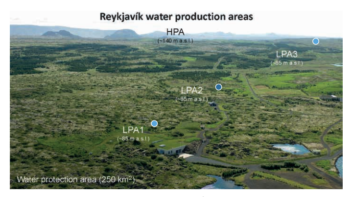
Figure 1: Veitur Water Utilities extracts from several boreholes spread across protected areas situated either in low areas LPA (85 m a.s.l.) or in high areas HPA (140 m a.s.l.). Each area has its own maximum capacity. The blue dots indicate the positions where BactoSense is installed.

Veitur Water Utilities provides water to approximately 150'000 people in South-West Iceland from four water production areas (Figure 1). The production capacity is about 2'400 L/s, but the annual production amounts to about 720 L/s, allowing flexibility in the selection of different wells at different times.