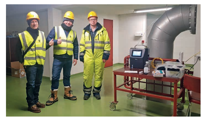
Figure 2: Installation of BactoSense

Veitur Water Utilities decided to use the BactoSense online flow cytometer, which allows for a quick onsite determination (about 30 minutes per analysis) of microbiological concentration (Figure 2).