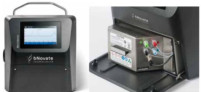
Figure 2: BactoSense with cartridge

Measurements at a pre-warning point between the river and the pumping system or directly in the pumping system can monitor the water quality before entering the grid system. BactoSense measures the total cell count (TCC), the high nucleic acid (HNA) and low nucleic acid (LNA)