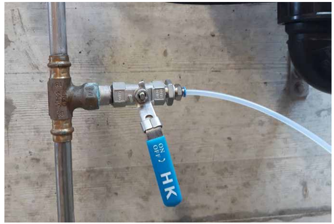
Figure 5: Simple control of the required water flow rate of 200 to 400 ml/min when continuously measuring with the BactoSense

Output 1: Signal source TCC, value range 4 mA = 0 TCC, 20 mA = 500'000 TCC