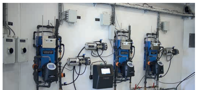
Figure 3: BactoSense installed in a groundwater well

cell counts continuously and precisely. TCC includes all microbial cells (intact and damaged), while HNA and LNA counts are measurements of the amount of DNA, large and small, respectively, contained in each cell. Measuring with BactoSense allows to detect an increase of microbe concentration in water within a few minutes. This early detection enables to take the right measures if the increased microbial exposure presents a danger for the drinking water treatment as well as for the drinking water quality. Furthermore, BactoSense provides the possibility to evaluate the influence of the water level of a nearby river or lake on the microbial quality of the groundwater. This is an important parameter to predict the quality of the water.